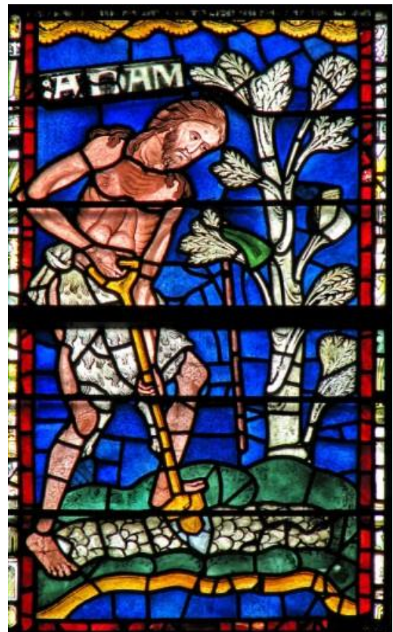
Adam Digging, Canterbury Cathedral c.1176-80