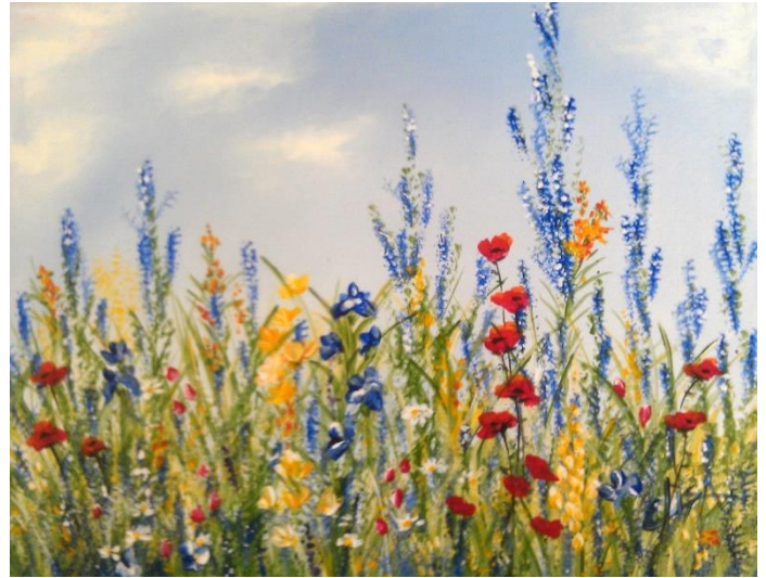
Consider the Flowers Growing in the Fields

Peace on Earth, Christian Unity, Sick & their Carers, Victims of Trafficking & those who combat it, Racial Justice, Unemployed.