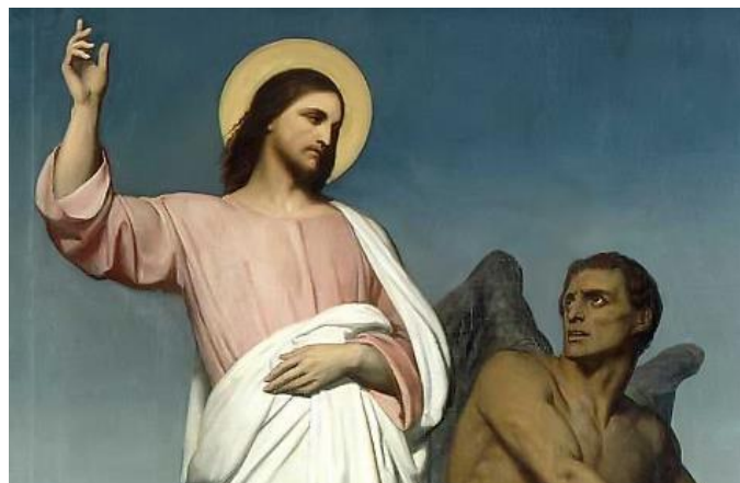
The Temptation of Christ