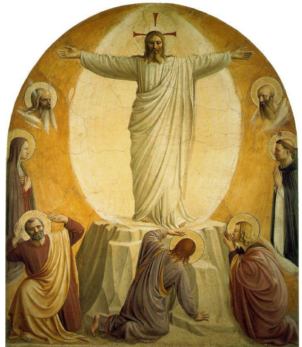
The Transfiguration Fra Angelico 1440-42