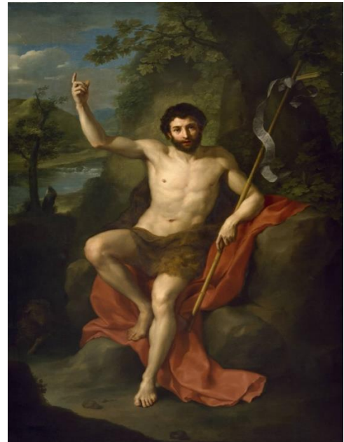
John the Baptist

New Members of the Church; Vocations; The Right Use of the Media; The Church; Human Work