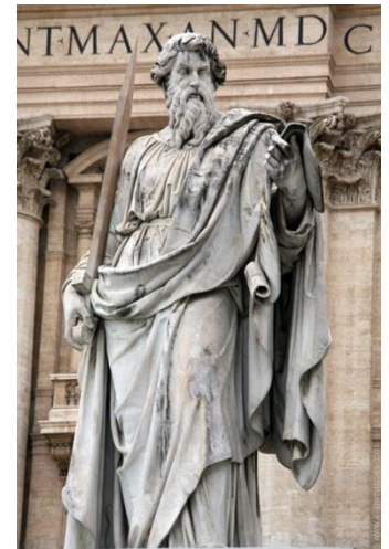
Statues of St Peter & St Paul at the Vatican