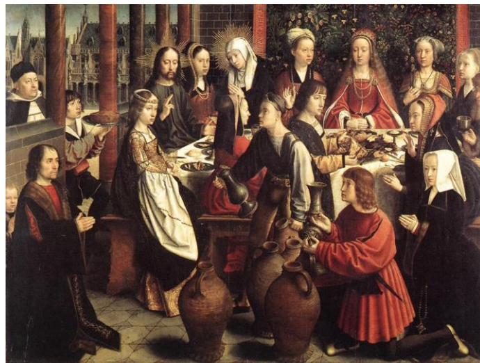
Marriage at Cana, 1500 Gerard David

New Members of the Church; Vocations; The Right Use of the Media; The Church; Human Work