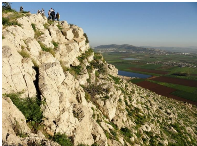
The traditional location of the place where the people of Nazareth tried to throw Jesus off a cliff

New Members of the Church; Vocations; The Right Use of the Media; The Church; Human Work