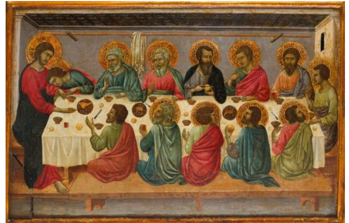
The Last Supper, Ugo di Nerio circa 1325-30.

New Members of the Church; Vocations; The Right Use of the Media; The Church; Human Work