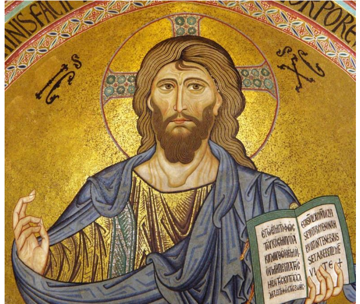
My Kingdom is not of this world