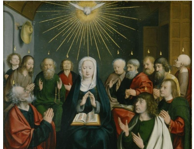
Pentecost Jan Joest van Kalkar (c. 1450 - 1519)

New Members of the Church; Vocations; The Right Use of the Media; The Church; Human Work