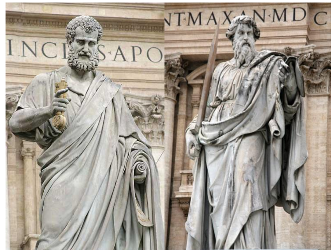
Statues of St Peter & St Paul at the Vatican

New Members of the Church; Vocations; The Right Use of the Media; The Church; Human Work