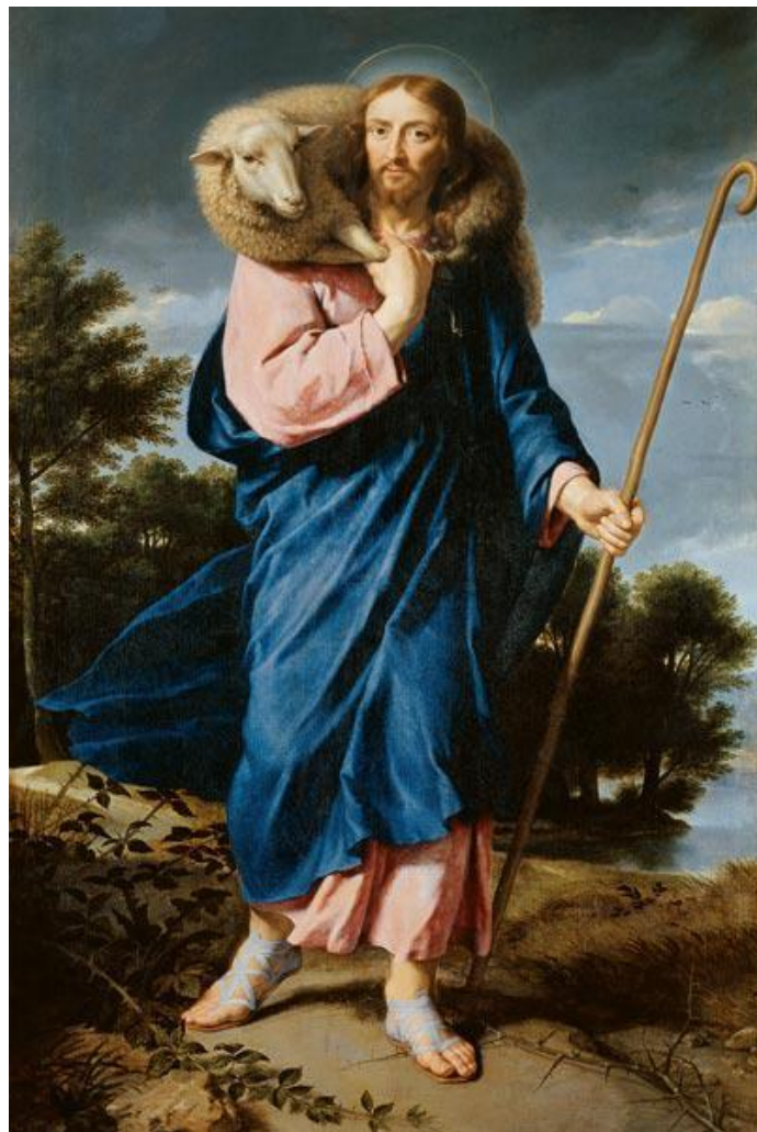
The Good Shepherd, Philippe de Champaigne (1602-74)

New Members of the Church; Vocations; The Right Use of the Media; The Church; Human Work