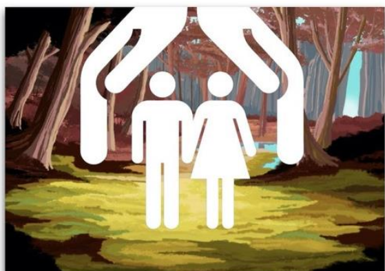
"But from the beginning of creation God made them male and female."

Jesus gives us a lot to think about in today's Gospel. He speaks especially on behalf of married women and of children. Both groups were vulnerable in Jesus' time and had little value or official protection. Women were too often seen as property, without social power to protect themselves from the whims of a husband's disloyalty or disinterest. Jesus re-iterates the unity of marriage. Husband and wife become one. They are no longer two but one body. Jesus gives us a glimpse or vision of God's loving plan. Jesus' words urge us to see the importance of marriage, rather than seeing commitment and love as fleeting.